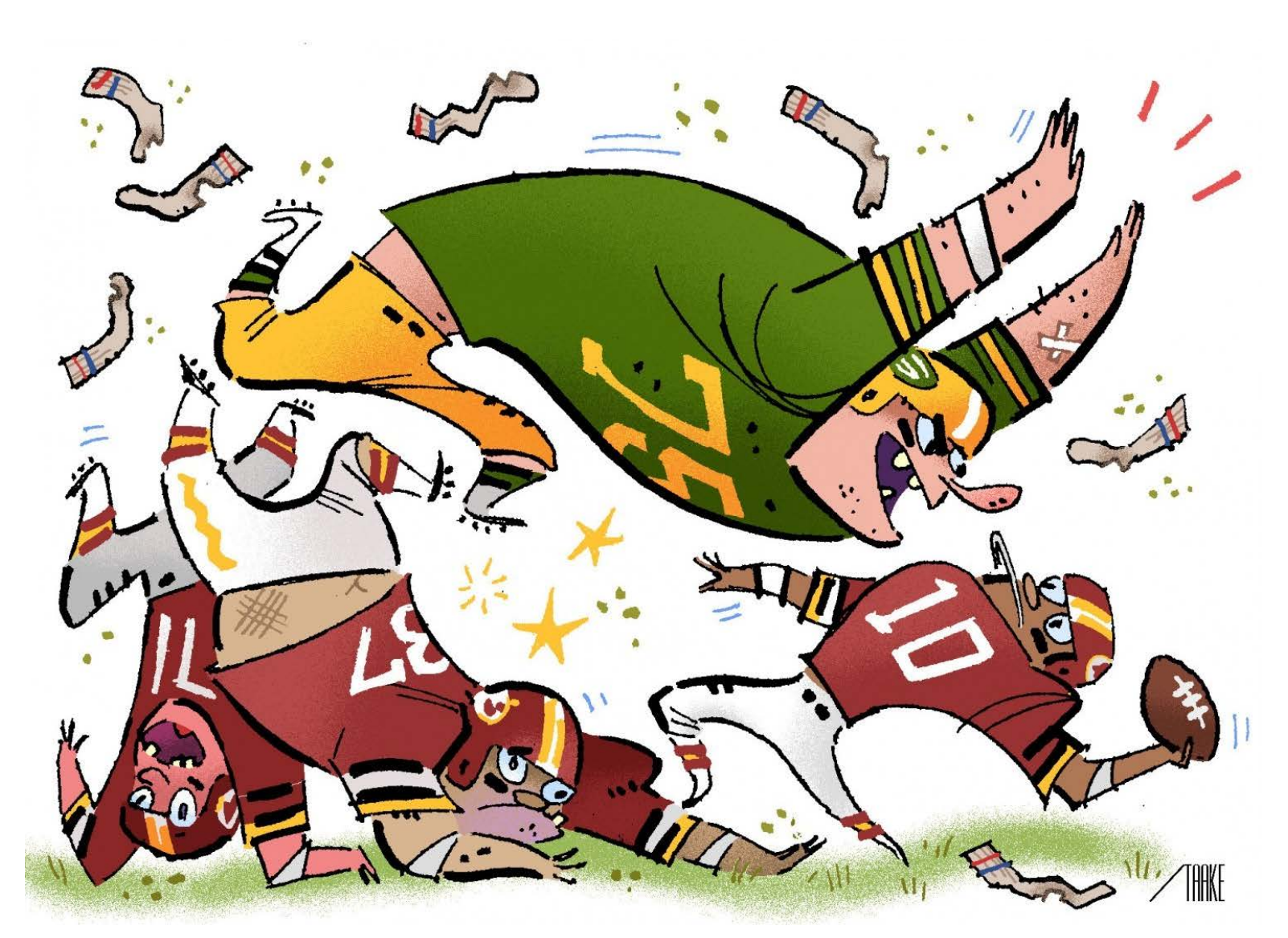
Holey, holey: socks and 'Skins.